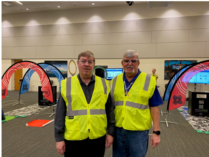
2024 Aerial Drone Competition