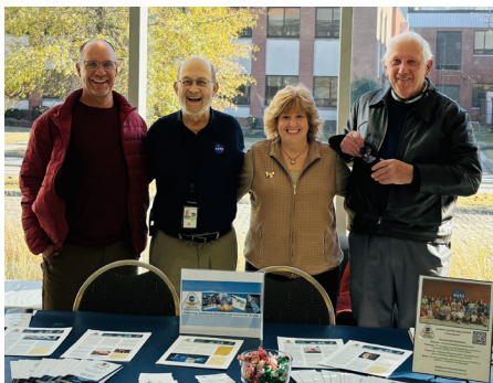
LAA table at the Director's Social 2024