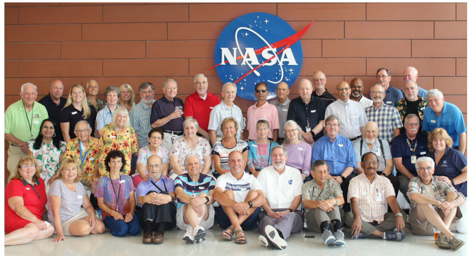
LAA members enjoying the July 2024 picnic